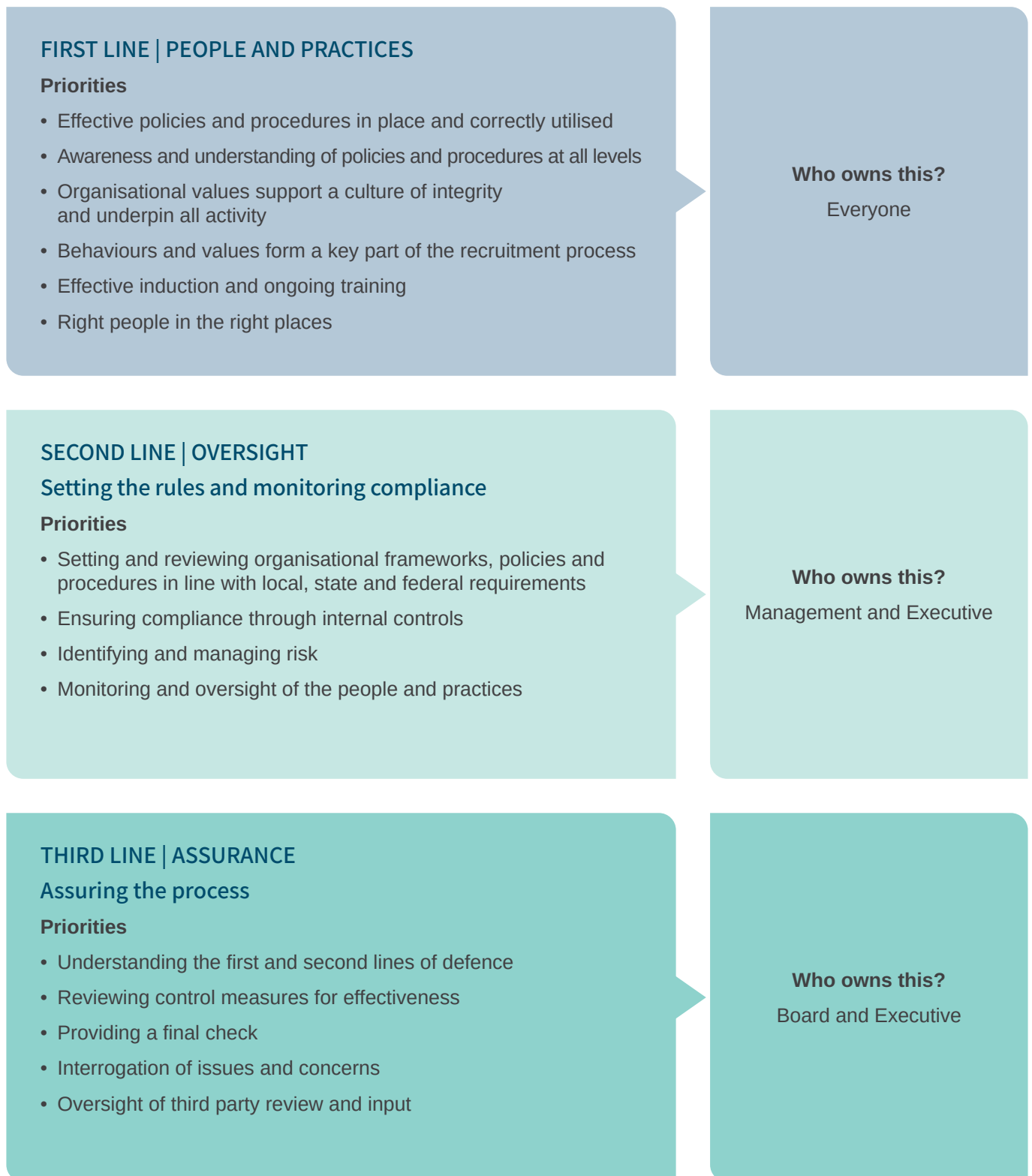
Figure 1 – Three Lines of Defence Risk Model